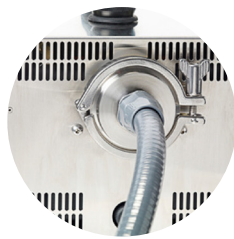
Hose Adaptor Connectors

The 6D can also be used for testing positive pressure systems using an optional positive injection pump (PIP) and hose adaptor. On-site routine maintenance is easy. And its integrated compressor makes implementation simple - all you need is a power source.