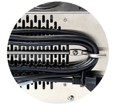
Power Cord Storage